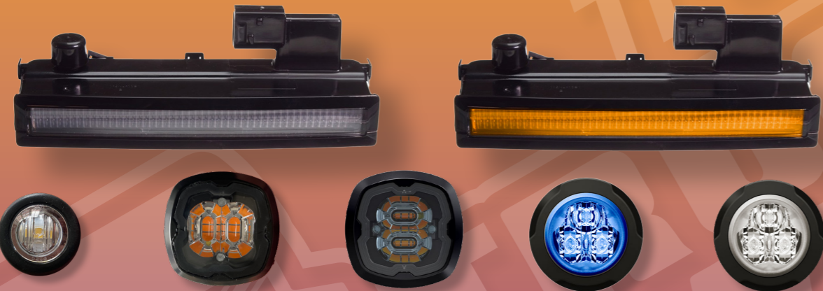
Emergency light and position lights in several variants