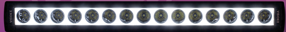
Powerful 75 W LED-bar - Vision X XPL HALO 21 with built-in halo-function.